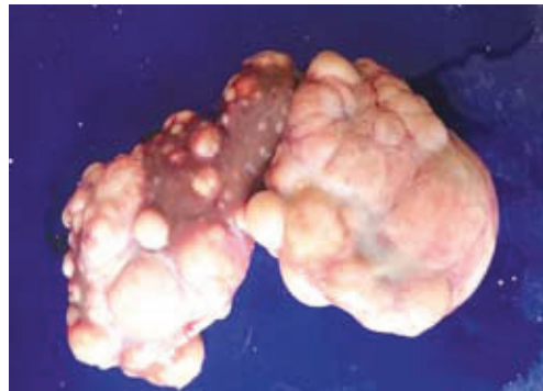
Fig 2: Multi focal yellowish, fluid filled umbilicated nodules of 3-4 cm diameter embedded in the liver parenchyma with a few cystic nodules.