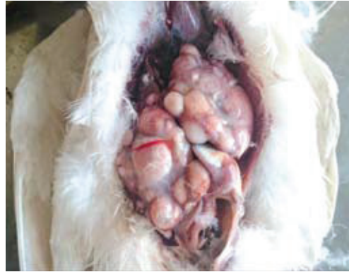
Fig 1: Liver containing varying sized nodules