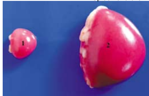
Figure 4 Comparison between spleen of broiler and layer chicken

According to Korte et al. (1999), in comparison with other classes of chickens, broilers are highly susceptible to heart failure. Cheriyan (2007) reported that as a result of advances in genetic selection, management and nutrition, the modern day commercial broiler chicken have fast growth rates, high feed conversion ratios and metabolic rates, thereby putting an increased workload in the cardiovascular system which resulted in metabolic, cardiovascular disorders and sudden death and an increased rate of mortality in broiler chicken. But the genetic and nutritional advancement in growth performance did not much concentrate on weight of internal organs in par with body weight. Olkowski (2007) observed that the modern strains of fast