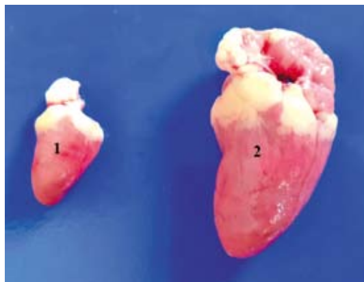
Figure 1 Comparison between heart of broiler and layer

The percent weight of spleen in broiler was 0.105±0.054 and that of layer was 0.177±0.030, indicating that the layer birds have a high percent spleen value than the broiler birds (Table 1 & 2). But Plavnik and Hurwitz (1982) observed that 0.18 ± 0.02 and 0.16 ± 0.06 was the percent spleen weights of male and female birds of 6 weeks of age which were close to the values in layer chicks of present study. Rodríguez et al. , (2006) and Gonzalez Alvarado et al. , (2007) did not observe any changes in the relative weight of spleen in laying pullets and broiler birds, respectively, fed different fibre sources.