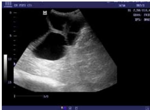
Fig 1: Early pseudopregnant uterus showing anaechoic uterine compartments separated by hyperechoic trabeculae.

The present investigation was carried out with the objective to compare serum progesterone and oestradiol concentration in pseudopregnant and pregnant goats below three months post-service at Teaching Veterinary Clinical Complex (TVCC), University Veterinary Hospitals (UVH), Mannuthy and Kokkalai and Goat and Sheep Farm, Mannuthy during May 2017 to April 2018. By ultrasonographical screening, pseudopregnant does (anaechoic to hypoechoic uterine compartments separated by trabeculae) below three months post-