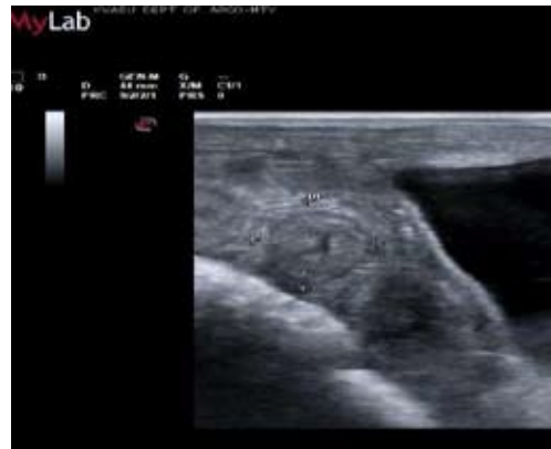
Fig 2: Involved uterus with mild intraluminal fluid accumulation and thickened endometrium (induced oestrus).

service irrespective of breed, age, parity and body conditions were selected for the study and were categorised as group I, which consisted of seven animals belonging to Malabari, Jamunapari, Beetal and its crosses with parity ranging from 1 to 5. On the day of diagnosis of pseudopregnancy (day 0), the group I animals were treated with first dose of cloprostenol sodium, 125 \mu g, intramuscularly and 12 days after the initial treatment, a second dose of cloprostenol (125 \mu g, IM) was administered. All the treated animals were subjected to natural service on two consecutive days of induced