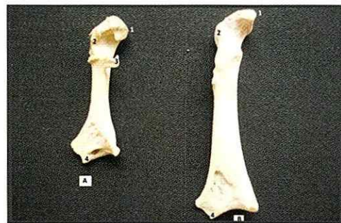
Fig.2. Coracoid of green-winged macaw (A) and peahen (B) - Medial aspect.

be the adaptations to counteract the powerful forces exerted by the pectoral muscles during flight in green-winged macaw. The stronger coracoids helped to hold the wings away from sternum during flight while the ribs prevented the thorax from collapsing during the downward stroke of the wings (King and Mc Lelland, 1975). The distal or sternal extremity presented a wide sternal articular surface which was concave transversely and convex vertically to eliminate all movement except extension and flexion. In both the species, the sternal extremity presented a well marked lateral process at the exterio-inferior angle (Fig.2).