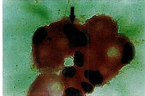
Fig. 1 - Infected tick salivary gland: Hypertrophied acini with parasitic mass

detected (Fig. 1). In the gut, the presence of parasitic stages was indicated by the hypertrophy of infected epithelial cells and vacuolations in the cell cytoplasm (Fig. 2). The oocytes in the ovaries also revealed blue coloured spherical masses denoting the developmental stages of the parasite (Fig. 3).