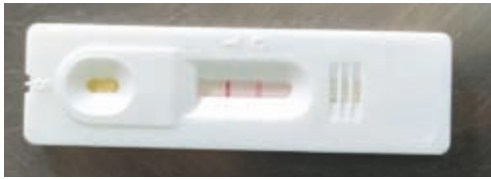
Fig.1. CPV Antigen test kit- Positive